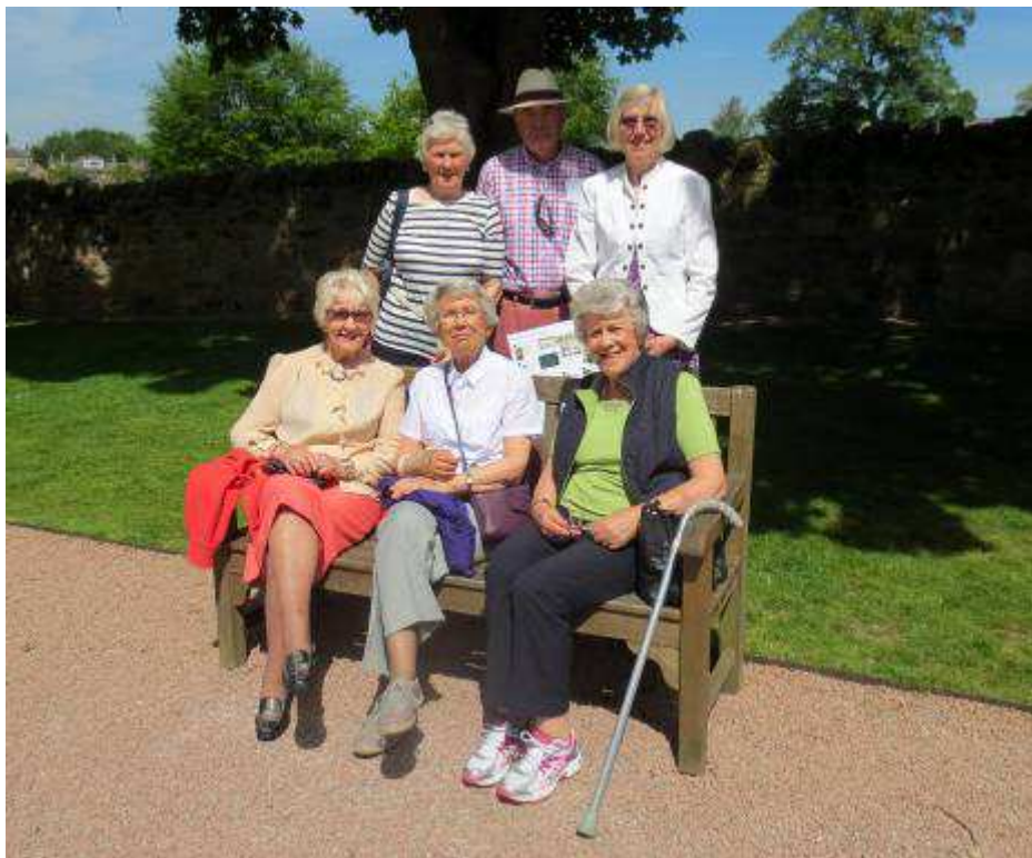
Some of our group enjoying the sunshine at Rosslyn Chapel

Our tour of the Chapel started with a talk on the history of the Chapel commencing at its foundation in 1446 with comments on the various developments up to the present time. Without doubt, the publication of Dan Brown's book, The Da Vinci Code , helped put Rosslyn Chapel on the international map. Nowadays, there are visitors to the Chapel from every part of the world.