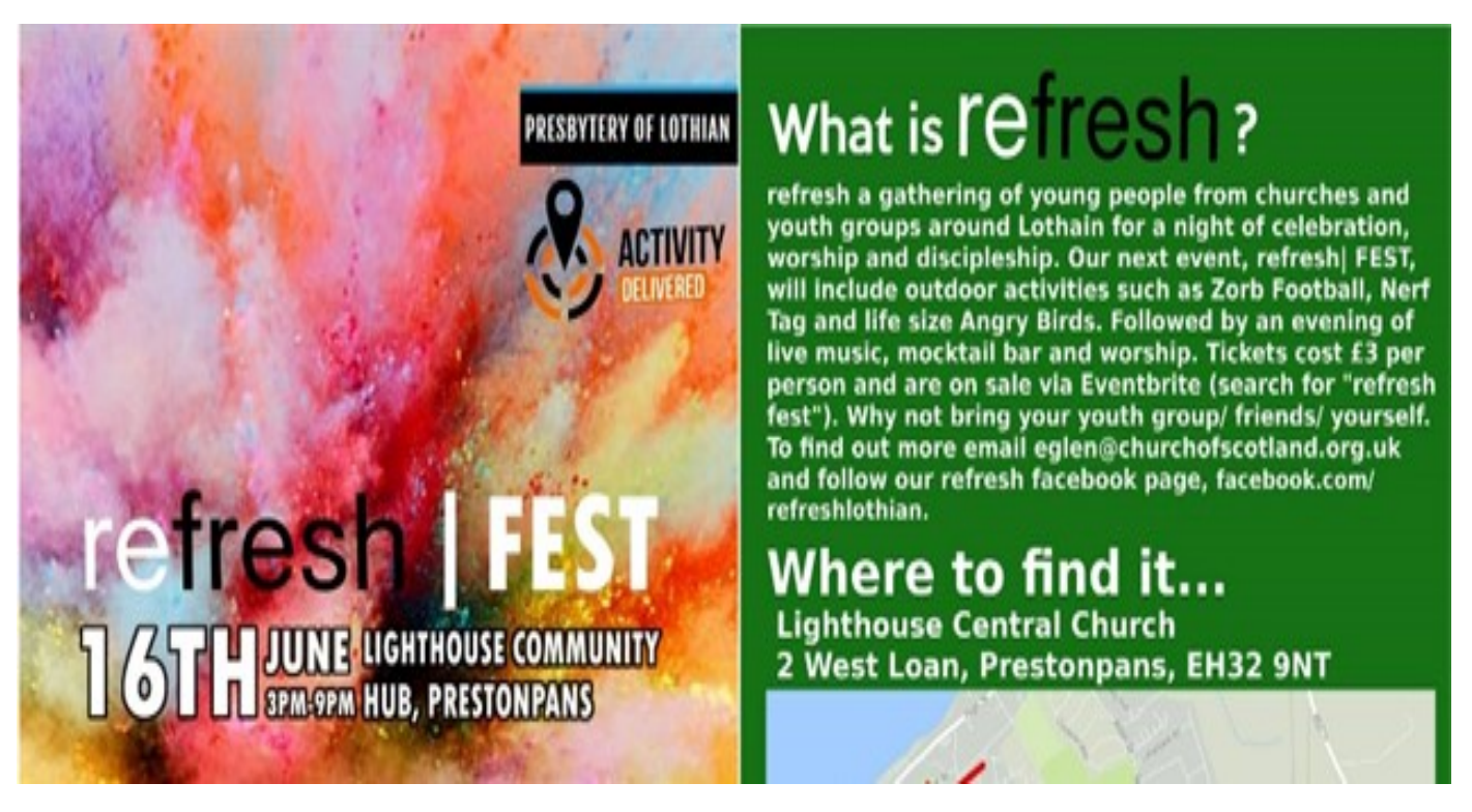
See the 'Refresh' Facebook page for details.

Please speak to the Minister for more information.